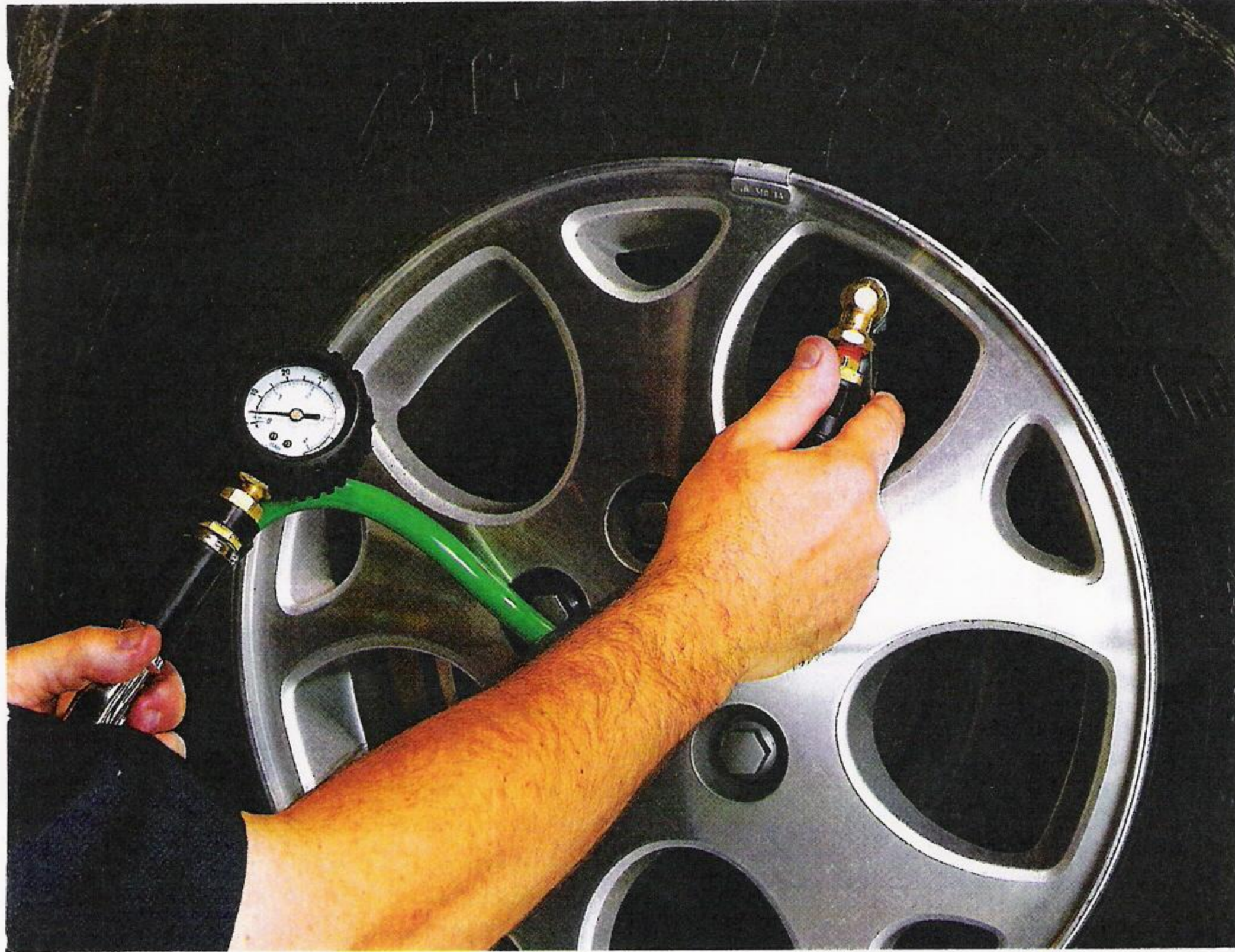
In auto pneumatics, green has become the universal color to designate nitrogen equipment: hoses, tanks, even sometimes valve stems. Regular-air top-ups are harmless, but the nitrogen purge process has to be done over.

Manufacturers such as Michelin, Goodyear, and Bridgestone all support nitrogen fills these days, citing the stable gas's ability to maintain inflation pressure over time. So should you make the switch? That depends. Basically, air is still free: If you check your tire pressures regularly and have no qualms with your Corvette's performance, you might decide there's no point in bothering. On the other hand, when you consider that you probably don't check your tires as often as you think you do, a small investment in nitrogen now might prevent bigger costs down the road. ○